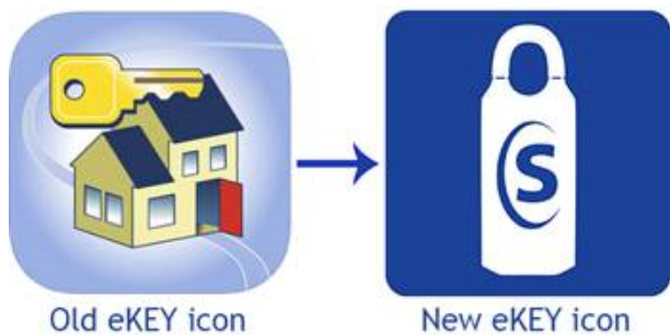
Old eKEY icon