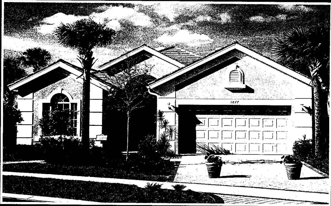
COVINGTON 2 Bedroom, 2 Bath, Den